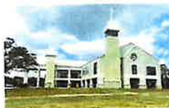
236 S. Beach Blvd., Waveland, MS 39576